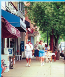
Downtown Churton St., Hillsborough