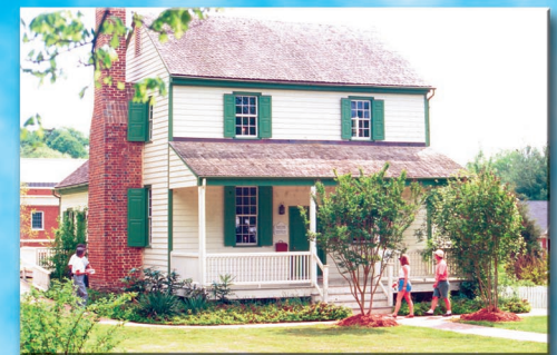
Visitor Center, Alexander Dickson House