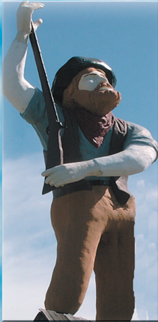
Entrance to The Shops at Daniel Boone